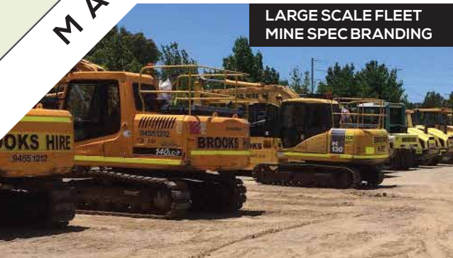
LARGE SCALE FLEET MINE SPEC BRANDING