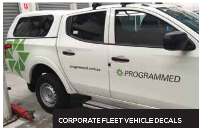
CORPORATE FLEET VEHICLE DECALS